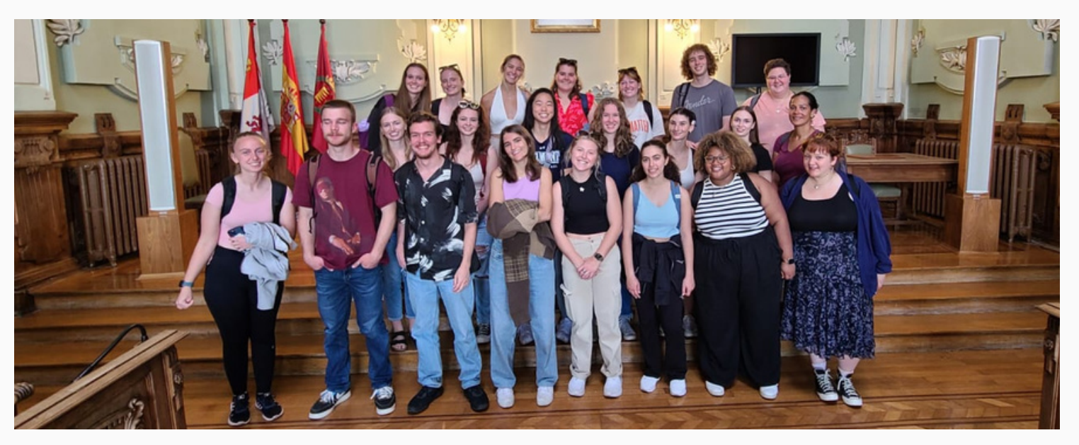
Students visiting the Mayor's Office in Ayuntamiento.